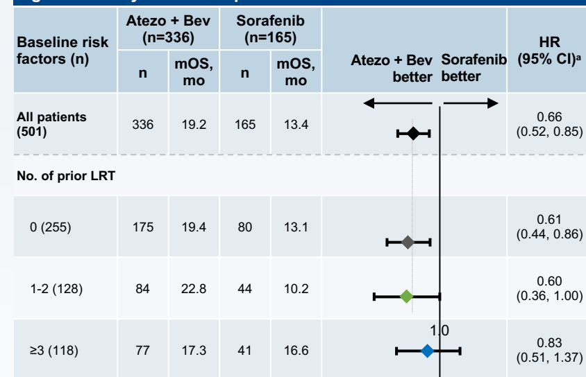
Figure 2. OS by number of prior LRT

Clinical cutoff: 31 August 2020; median follow-up: 15.6 mo. a Per electronic case report form, not interactive voice/web response system. b Data are not included for 1 patient in the atezo + bev arm whose classification was B7 and 2 patients with missing data. c Baseline ALBI grade was missing for 1 patient. d For patients whose cause of HCC was multifactorial as assessed by the investigator, the viral cause was prioritized over non-viral causes to define the primary etiology of the patient.